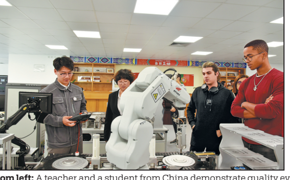
From left: A teacher and a student from China demonstrate quality evaluation for Portuguese students at the Luban Workshop in Portugal. Students are trained at the Luban Workshop in Thailand.

tional preparation period to learn Chinese technologies, craftsmanship and products. "This effort is meaningful for China, partner countries, and the world," he noted.