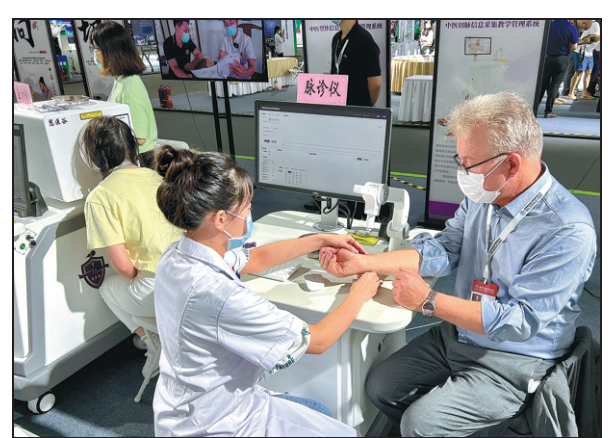
A student from Tianiin Medical College does an examination for a foreign guest at the 2022 conference.

High-ranking officials from 20countries are expected to be present at this year's ministeriallevel roundtable to discuss and share their experiences in vocaeducation development